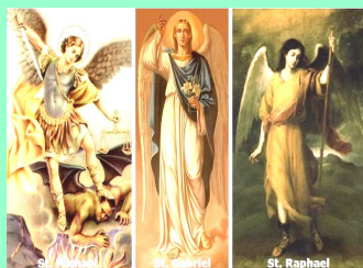
29 September Feast of the Archangels