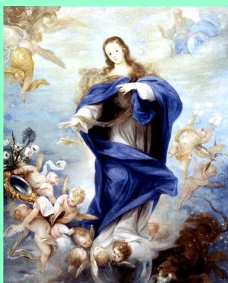
12 September Holy name of Mary Feast Day